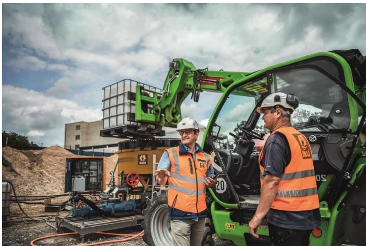
(4) Over 70,000 l of active ingredient emulsion and about 430 l of bacterial suspension were injected into the contaminated soil.