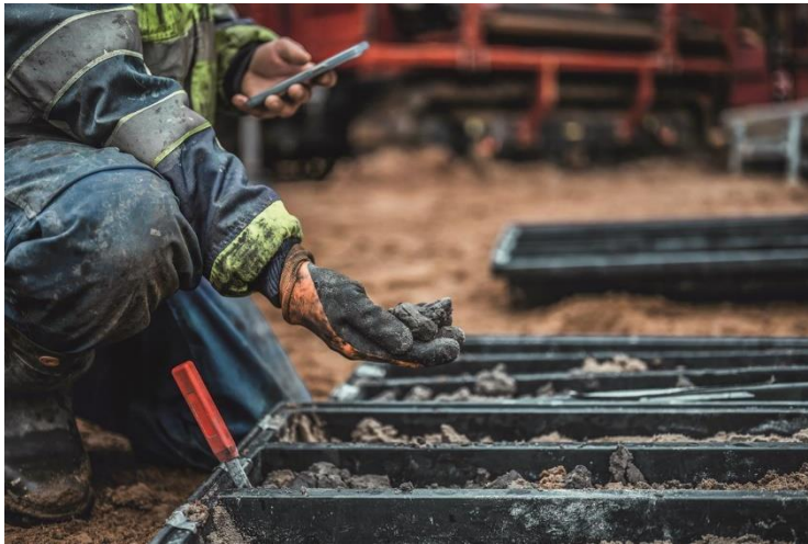
(3) Taking samples to evaluate the subsurface conditions