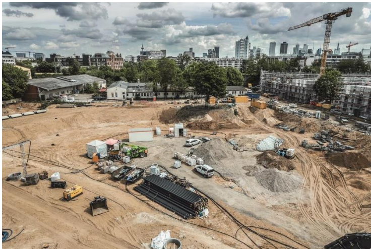
(1) Since January of this year, the Bauer Umwelt Division of BAUER Resources GmbH has been rehabilitating a former industrial site in Frankfurt's Gallusviertel district.